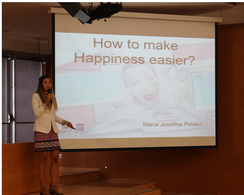
Over these lines, two researchers presenting their winner pitches of the Contest's pilot edition, organized by the Universitat Jaume I.