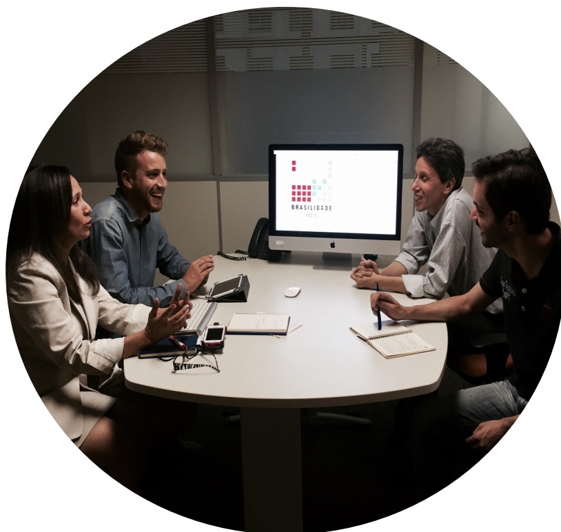
Above this lines, different participants of the STELLA programme during their mobilities in the UNESP in Sao Paulo (Brazil), the University of Arizona (USA) and the PUCP(Peru)

Check the Handbook of Guidelines for Universities, Coordinators and Staff and other relevant information in our website .